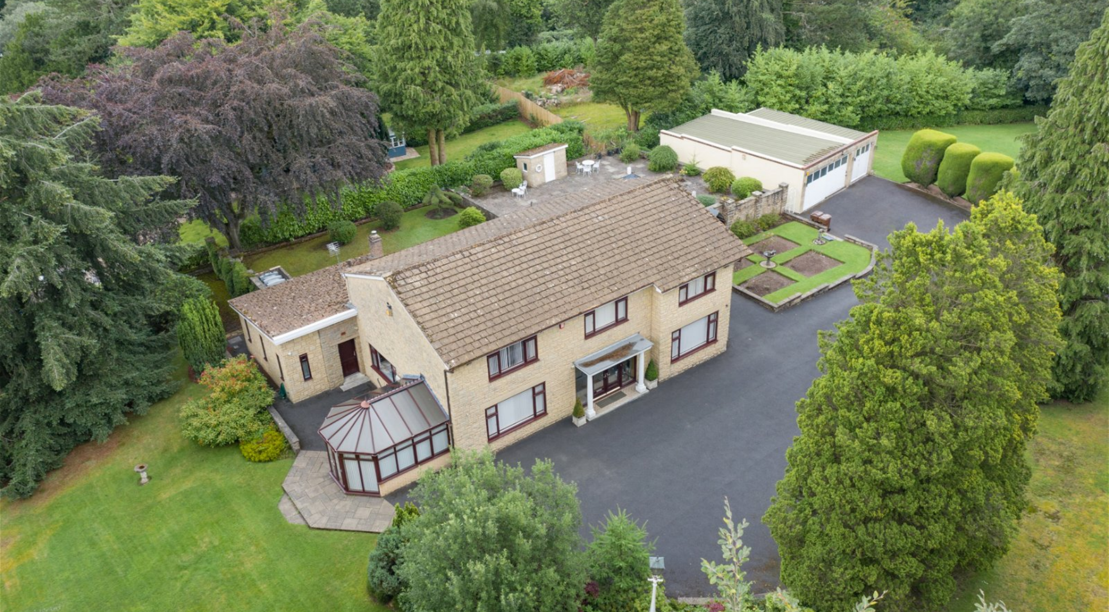
Rose Hill House, 1 Warren Lane, Lickey, B45 8ER