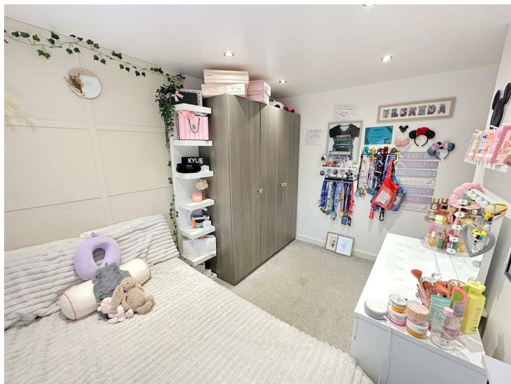
Bedroom Three 9'0" x 7'5" (2.762m x 2.283m)