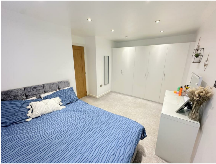
Bedroom Two 10'10" x 7'10" (3.306m x 2.389m)