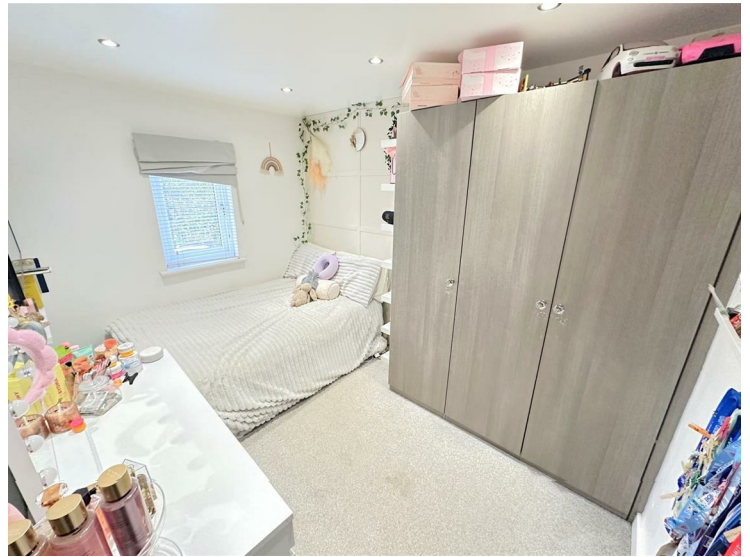
A double bedroom incorporating a double glazed window to front, radiator, fitted wardrobe/storage and inset ceiling lights.