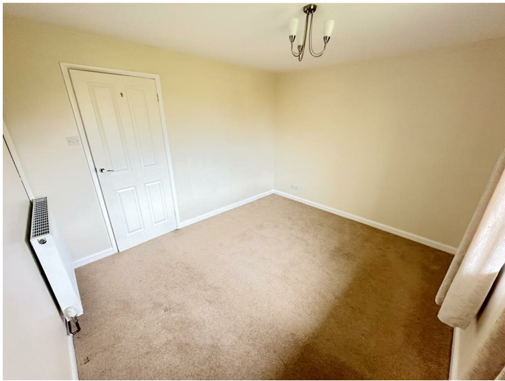
A double bedroom incorporating a double glazed window to side and a radiator.