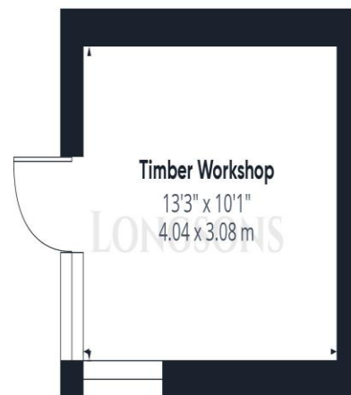
Floor 0 Building 3