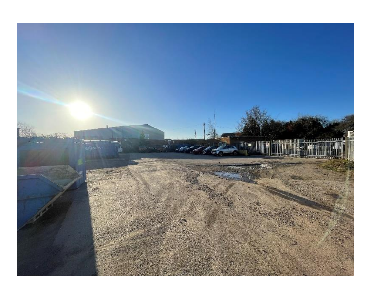
Siddall Jones | The Mint | 95 Icknield Street | Birmingham | B18 6RU

Strictly via prior appointment with the sole agent Siddall Jones on {\bf 0121~638~0500}