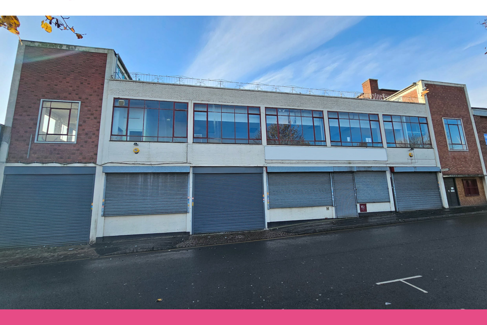
72 Buckingham Street