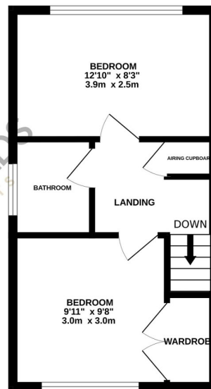
1ST FLOOR 310 sq.ft. (28.8 sq.m.) approx.