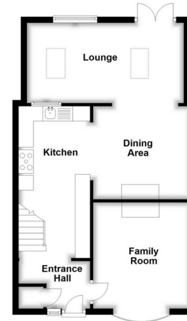
First Floor Approx. 40.8 sq. metres (439.2 sq. feet)