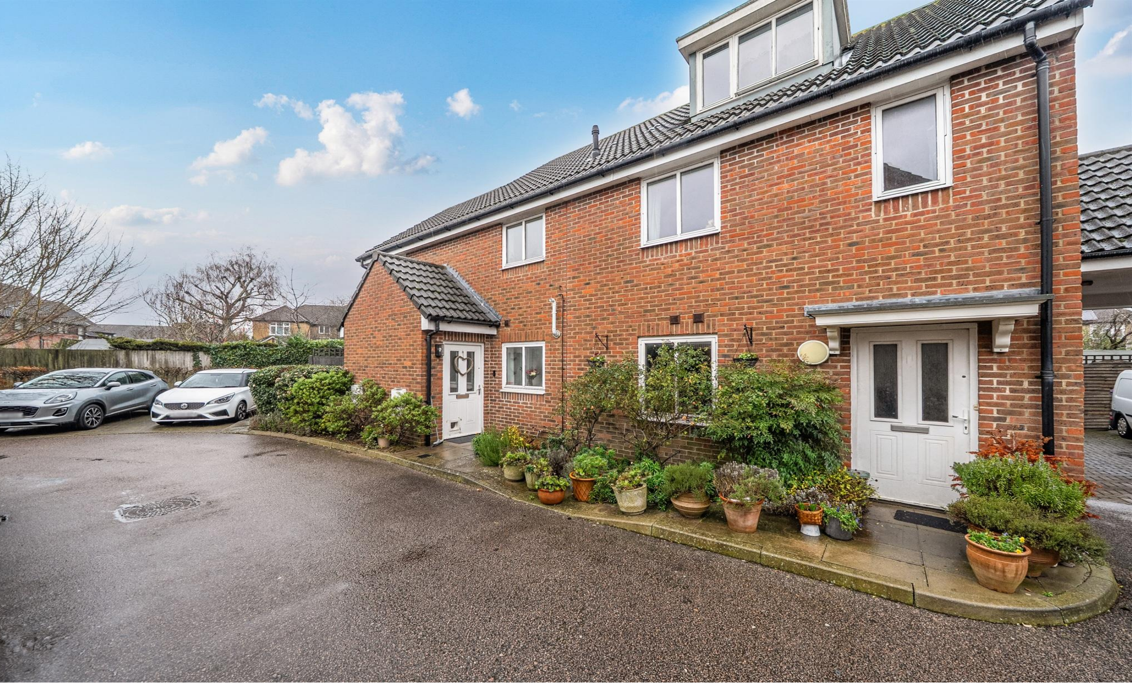
Staveley Court, Keswick Close, St. Albans, AL1 5FN