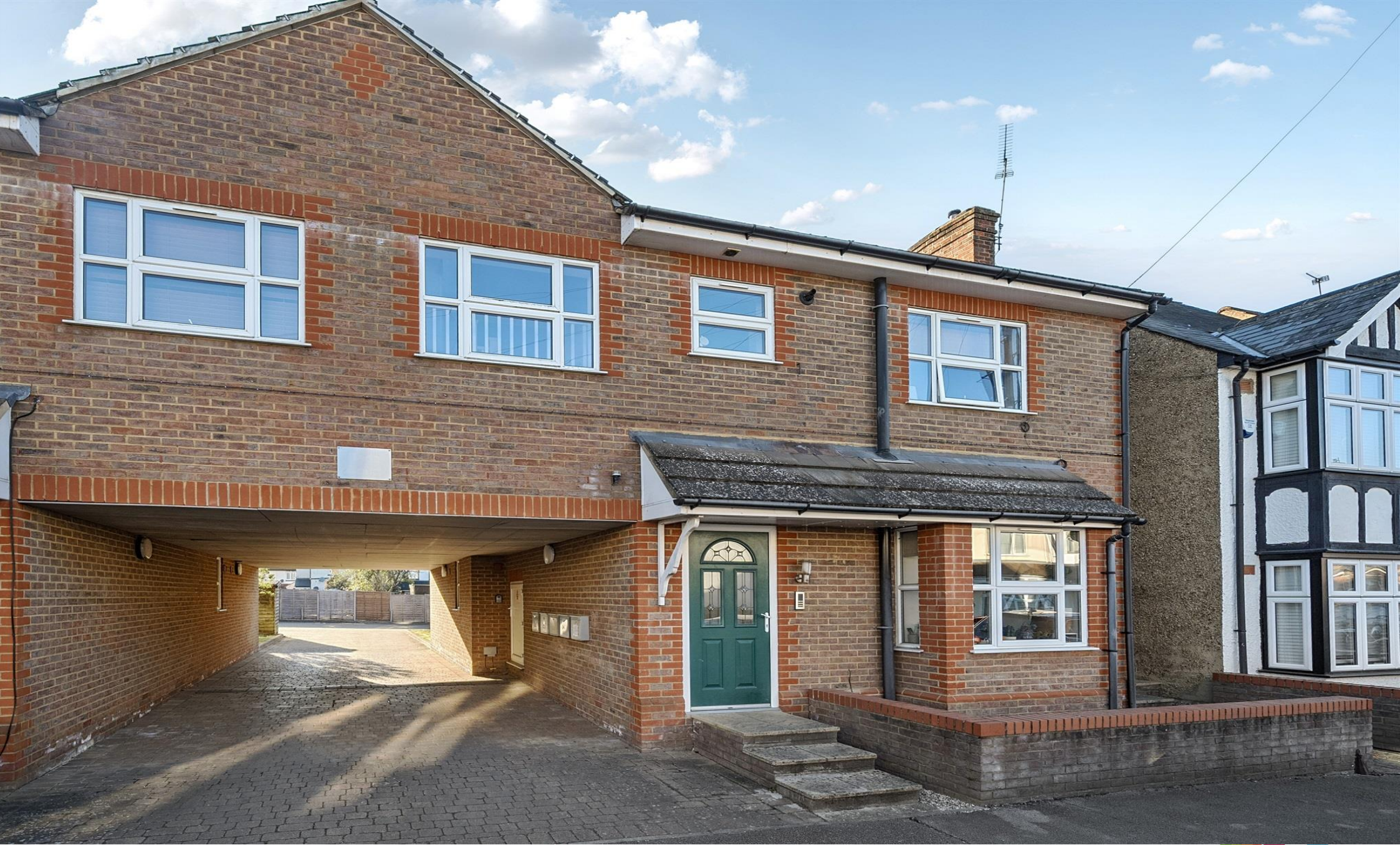
Bede Court, Royston Road, St. Albans, AL1 5NF