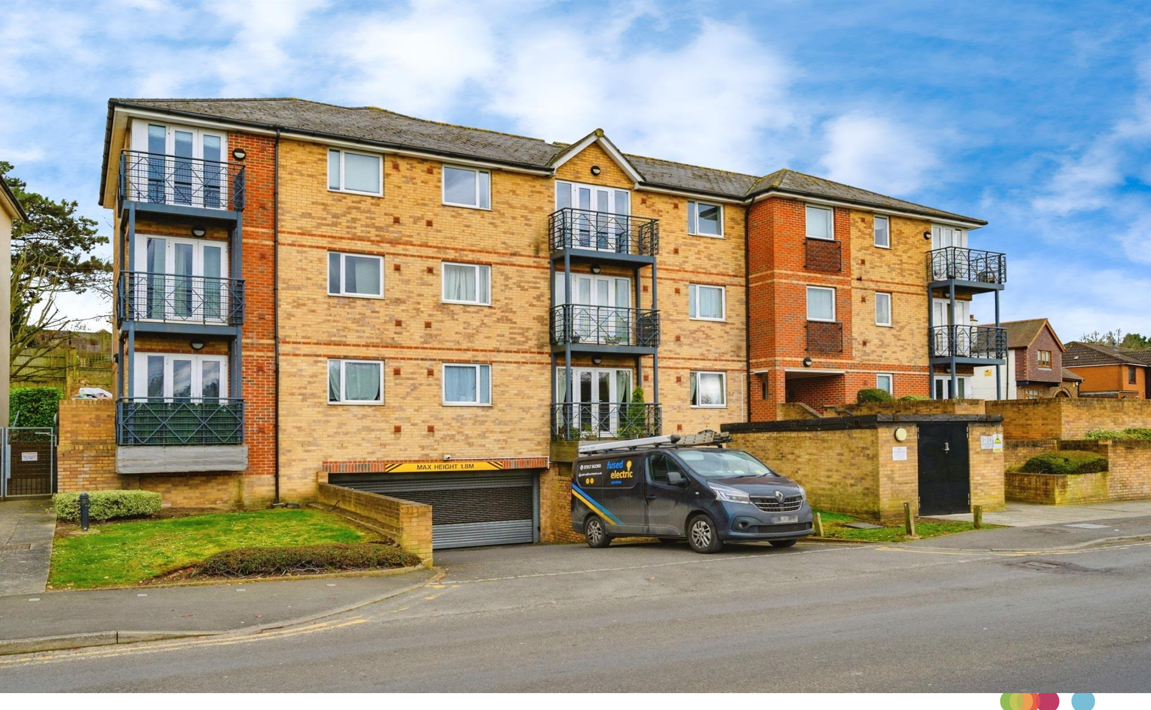
Bridgepoint Court, Old Watford Road, Bricket Wood, St. Albans, AL2 3FB