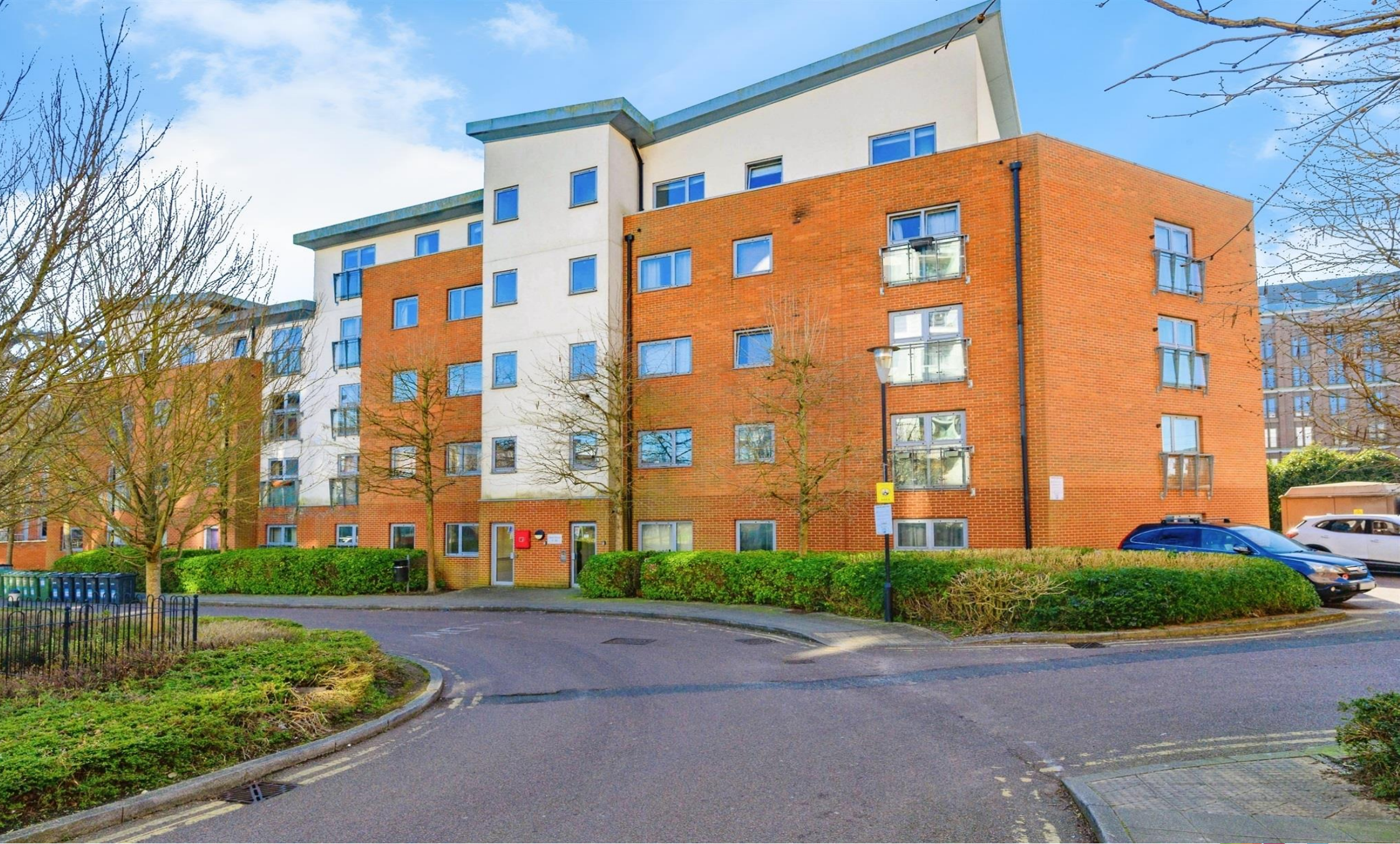
Davy House, Charrington Place, St. Albans, AL1 3FL