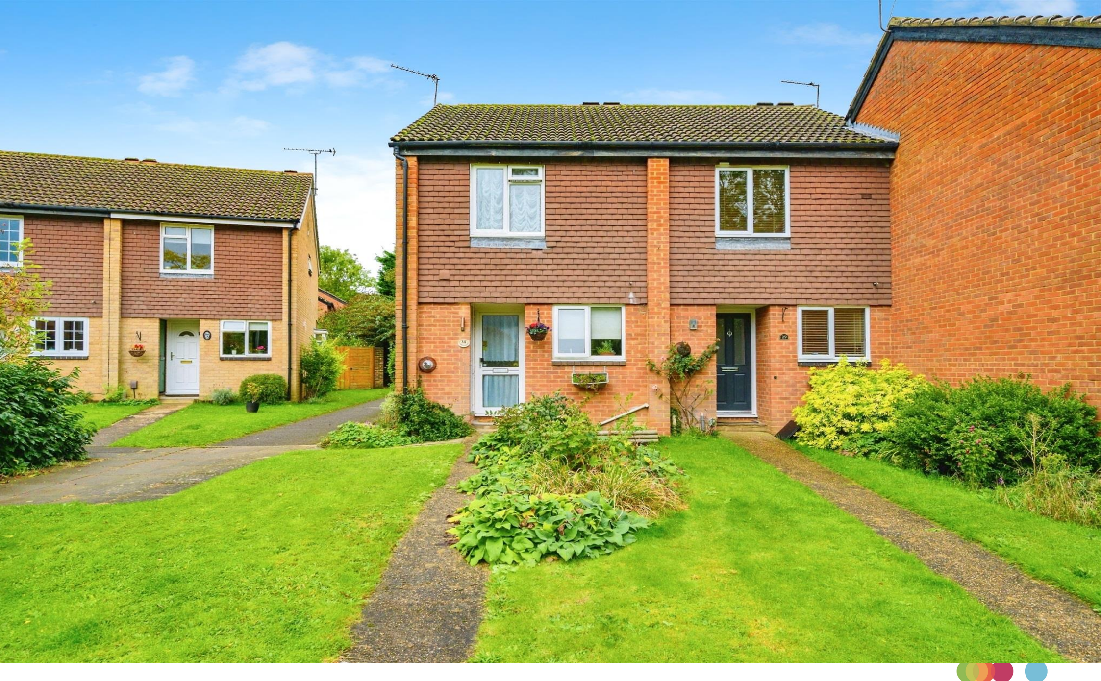
Craiglands, St. Albans, AL4 9AH