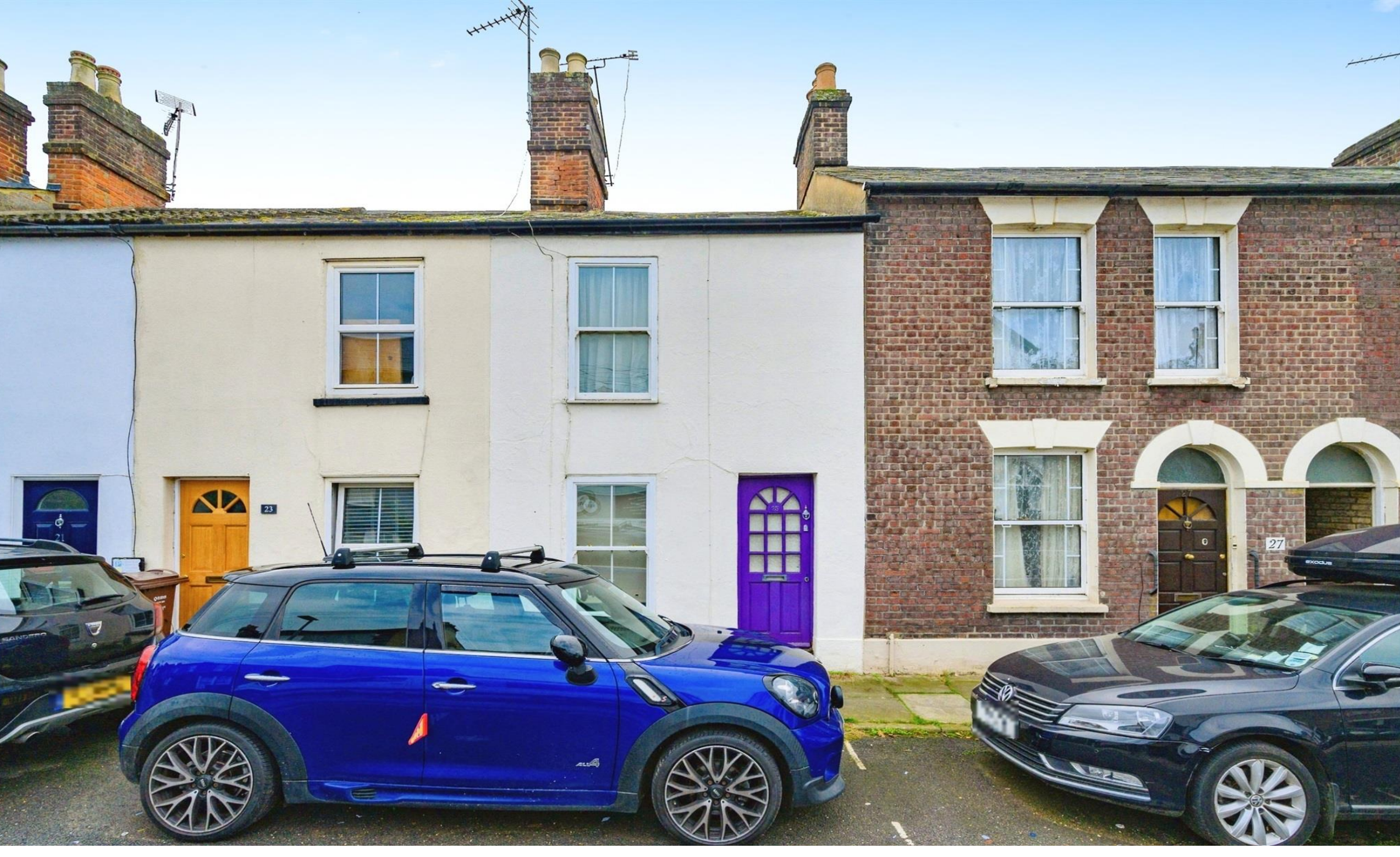
Grange Street, St. Albans, AL3 5NA