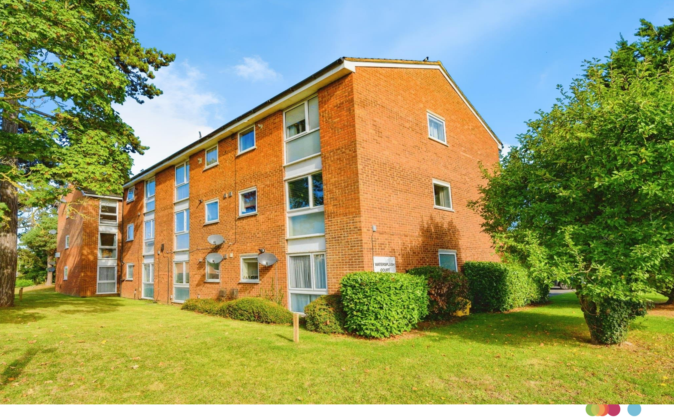
Watersplash Court, London Colney, St. Albans, AL2 1TN