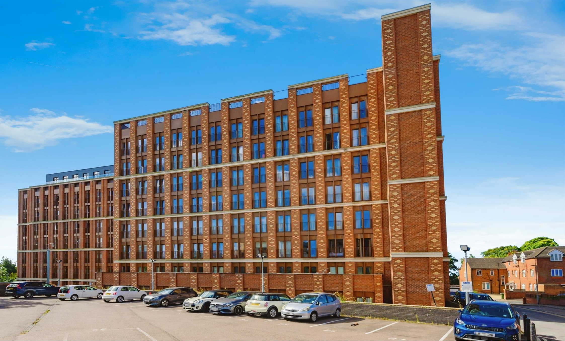
Ziggurat House, Grosvenor Road, St. Albans, AL1 3UP