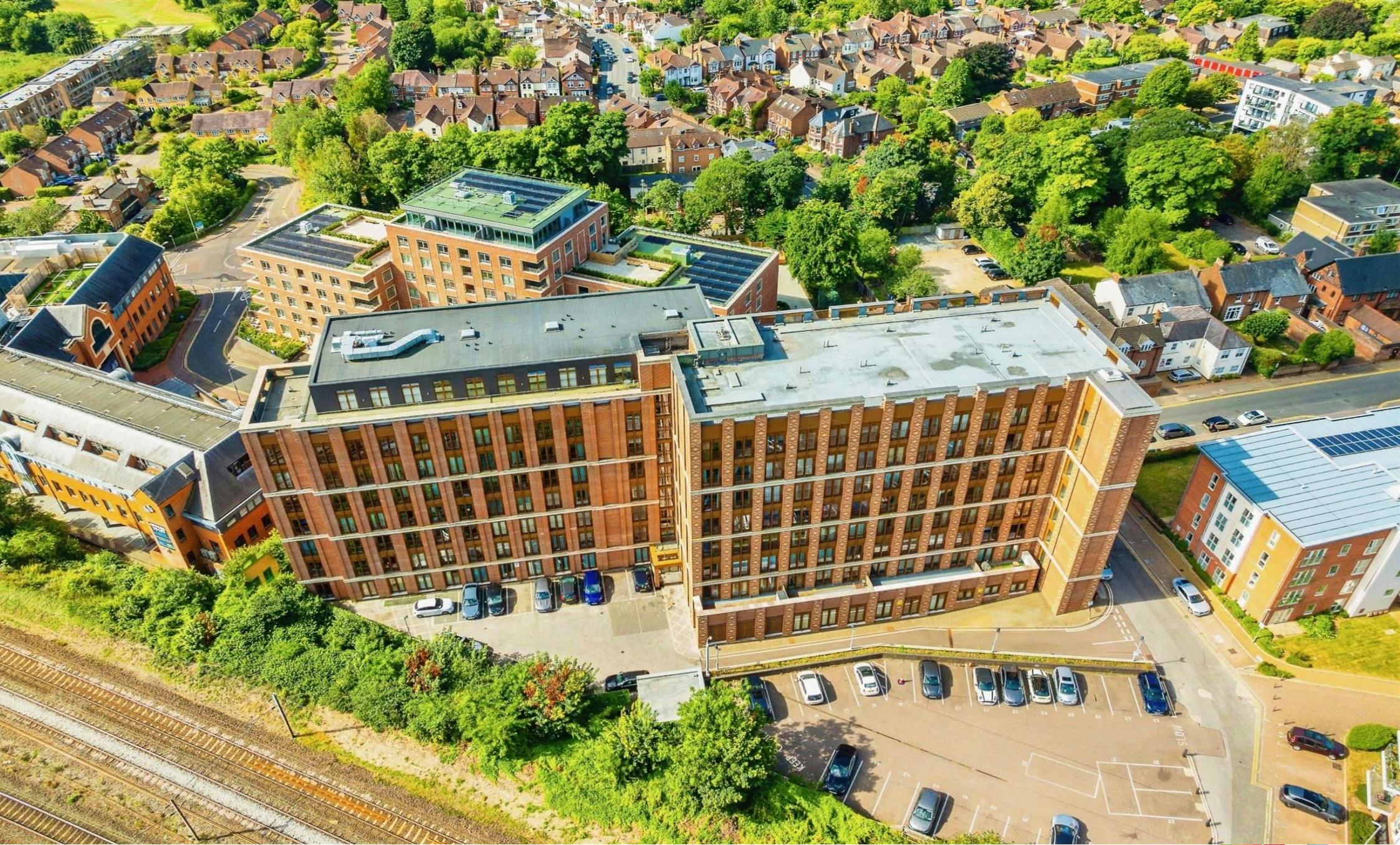
Ziggurat House, Grosvenor Road, St. Albans, AL1 3UP