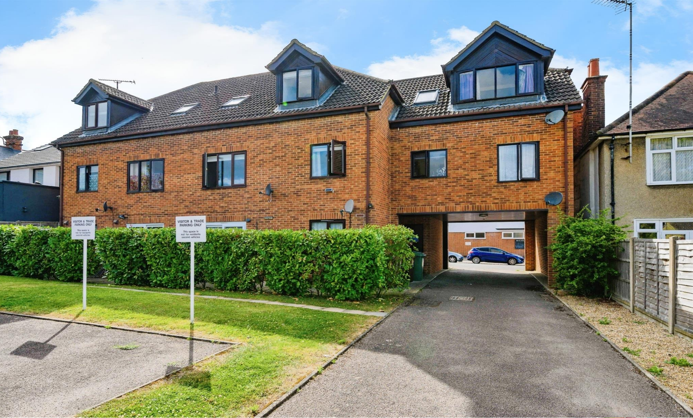
Sunbury Court, College Road, St. Albans, AL1 5PJ