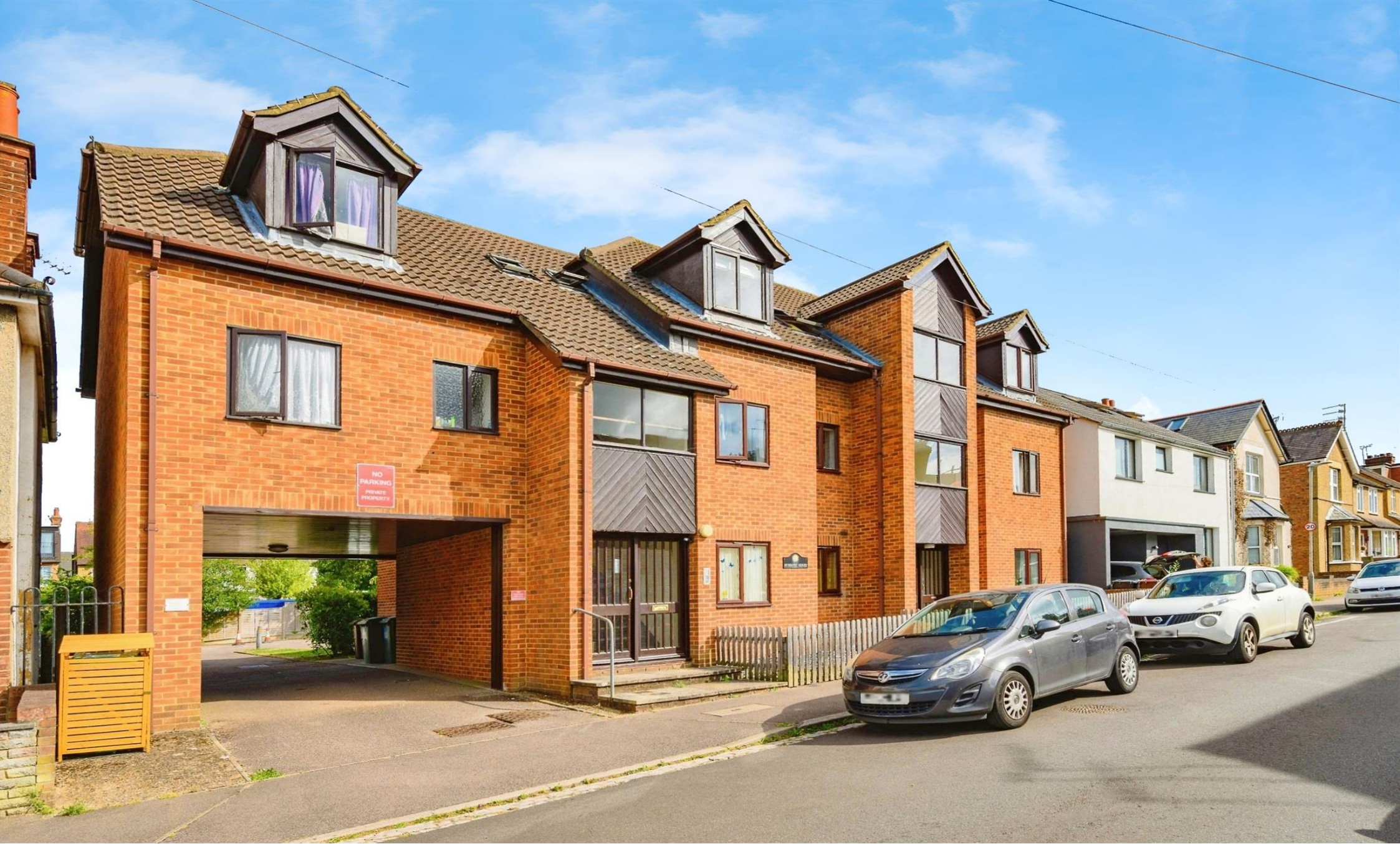
Sunbury Court, College Road, St. Albans, AL1 5PJ