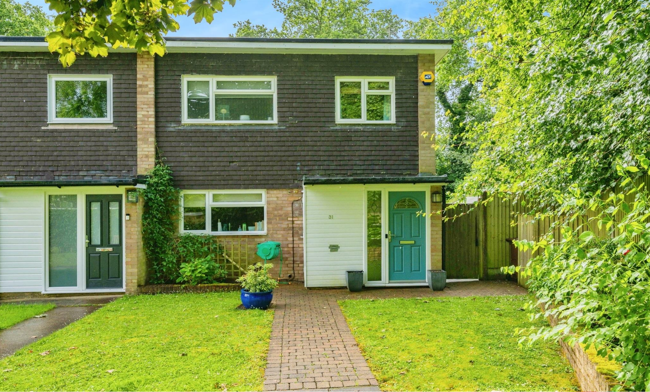
Meadowcroft, St. Albans, AL1 1UD