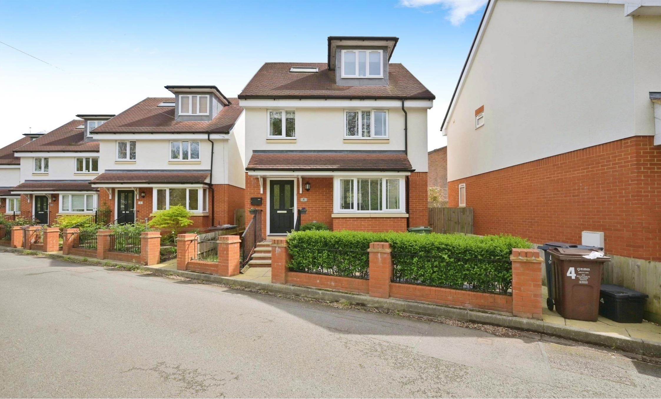
Lowbell Lane, London Colney, St. Albans, AL2 1AZ