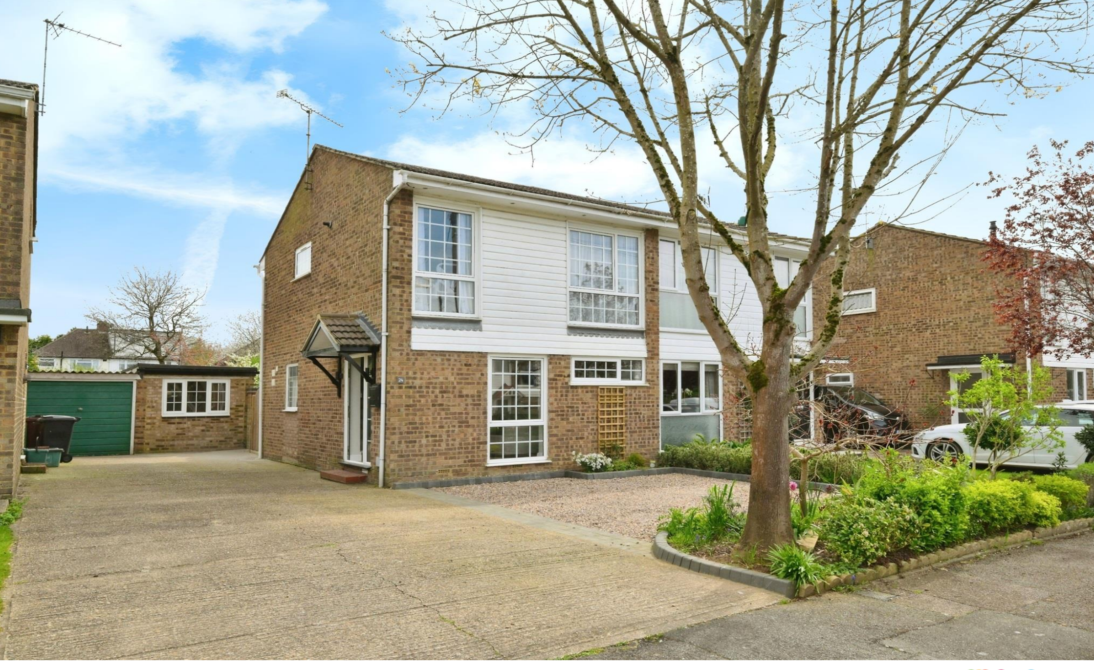
Franklin Close, Colney Heath, St. Albans, AL4 0QL