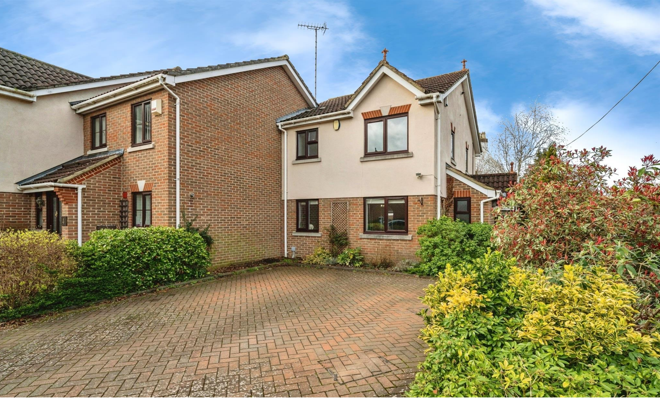
Colnbrook Close, London Colney, St. Albans, AL2 1BS