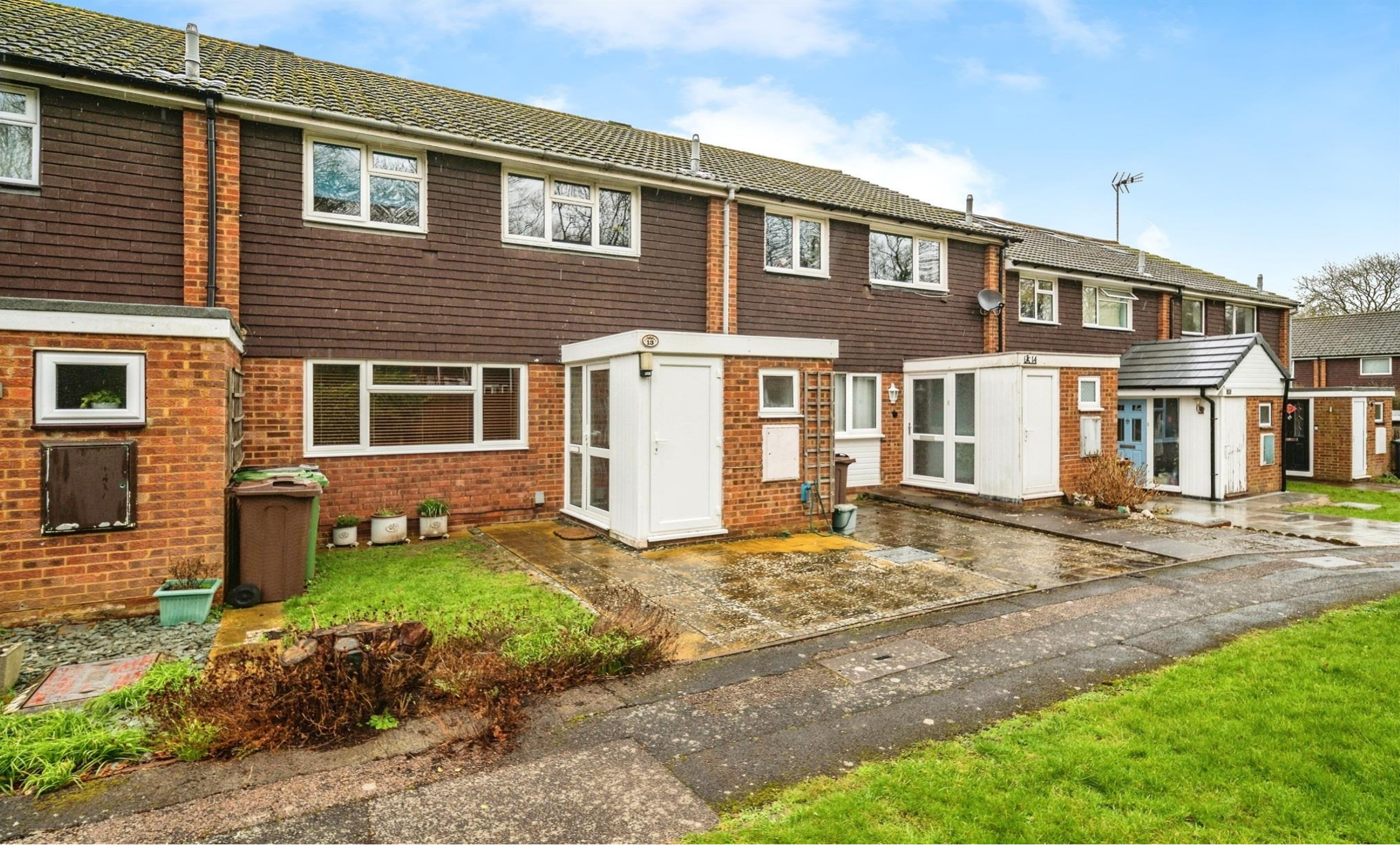
Potters Field, St. Albans, AL3 6LJ