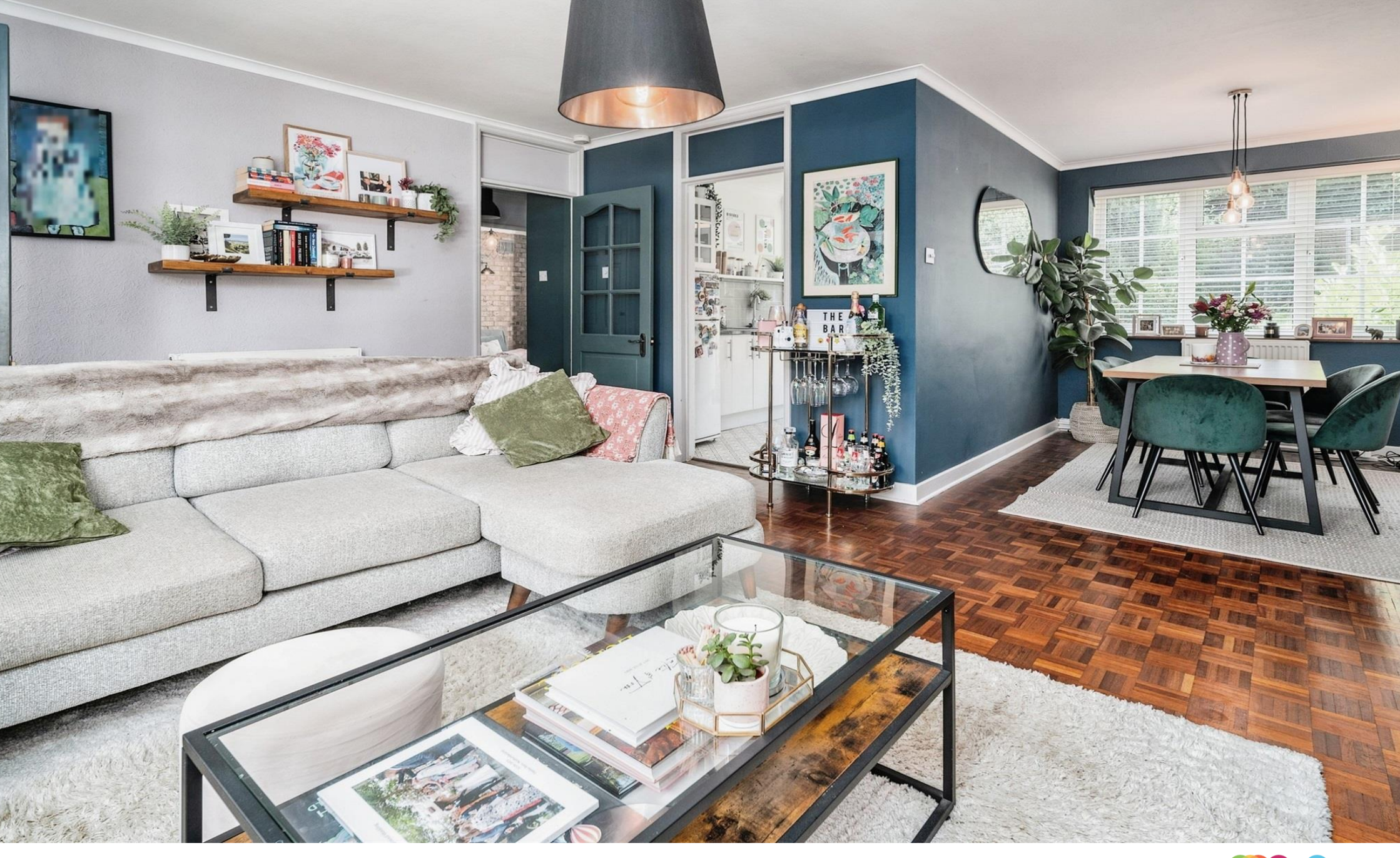
Westminster Court, St. Albans, AL1 2DU