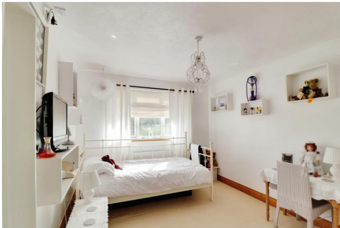
BEDROOM THREE 9' 4" x 8' 7" (2.84m x 2.62m) UPVC double glazed leadlight window to front aspect. Radiator.