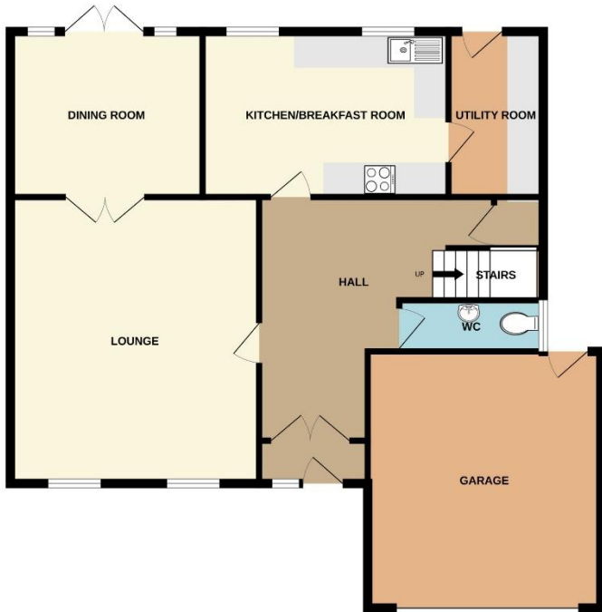
GROUND FLOOR 1096 sq.ft. (101.8 sq.m.) approx.