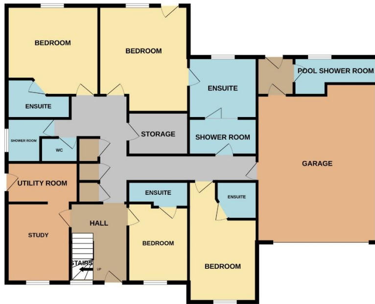
1ST FLOOR 1591 sq.ft. (147.8 sq.m.) approx.