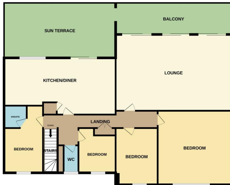
TOTAL FLOOR AREA : 3364 sq.ft. (312.5 sq.m.) approx. Made with Metropix ©2024