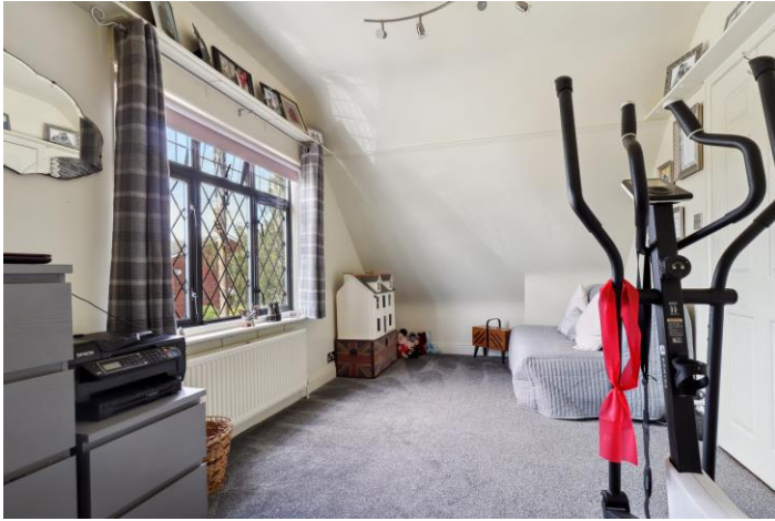
BEDROOM THREE 14' 5" reducing to 8' 5" x 10' 9" (4.39m > 2.57m x 3.28m)

Skimmed ceiling. Double glazed window to side aspect. Radiator. Walk in wardrobe area.