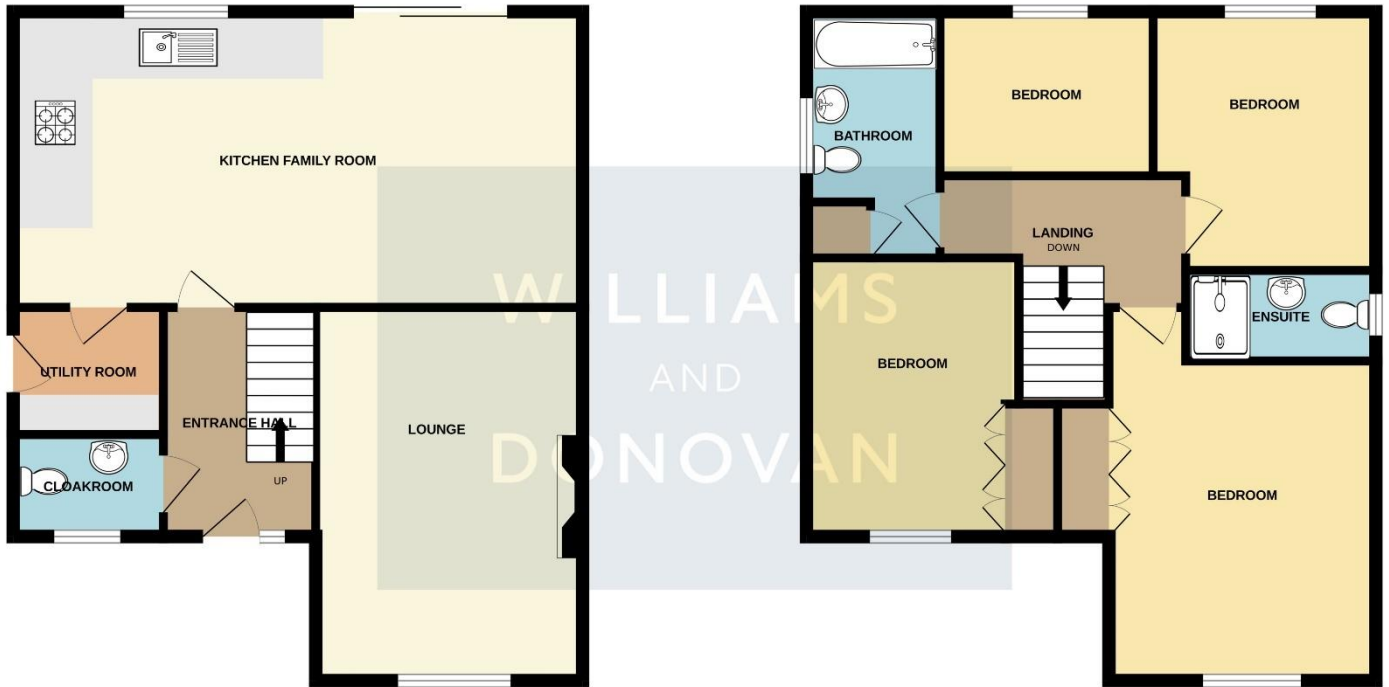
1ST FLOOR 650 sq.ft. (60.4 sq.m.) approx.

TOTAL FLOOR AREA : 1295 sq.ft. (120.3 sq.m.) approx.