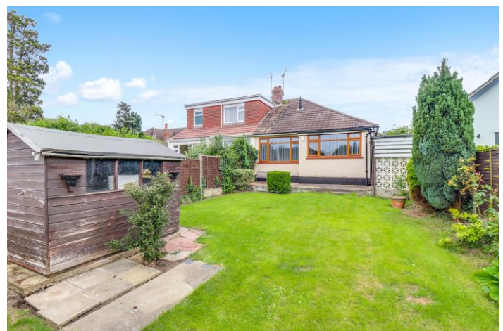
The REAR GARDEN measures approx. 45' and commences with patio area leading to lawn. Shrub borders. Shed to remain. Gated side access. Exterior power and lighting.