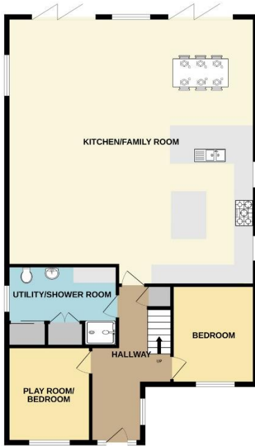
GROUND FLOOR 1244 sq.ft. (115.6 sq.m.) approx.