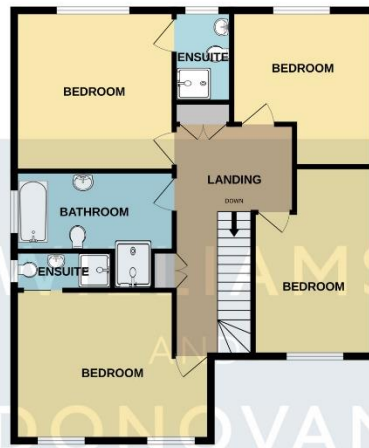
1ST FLOOR 844 sq.ft. (78.4 sq.m.) approx.