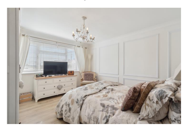
BEDROOM TWO 11' 9" x 10' 4" (3.58m x 3.15m) Skimmed ceiling. Double glazed window to front aspect. Radiator. Laminate flooring.

Skimmed ceiling. Double glazed window to rear aspect. Radiator. Laminate flooring.