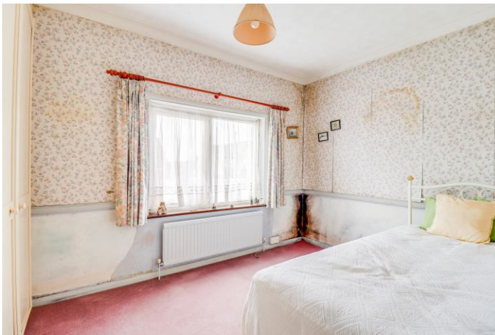
BEDROOM THREE 11' 6" reducing to 8' 4" x 10' 1" (3.51m < 2.54m x 3.07m) Double glazed window to rear aspect.