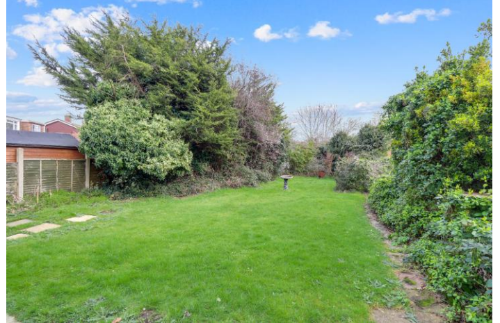
The REAR GARDEN measures approx. 75' and commences with paved patio leading to lawn. Mature shrub borders. Gated side access. Outside tap.