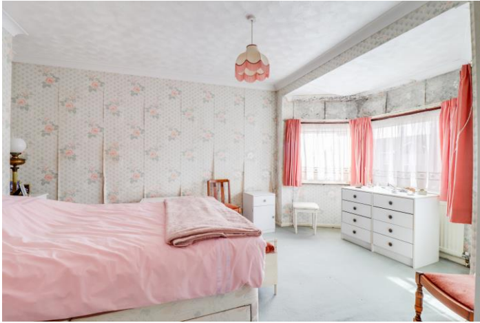
BEDROOM TWO 10' 2" x 8' 2" (3.1m x 2.49m) Double glazed window to front aspect. Built in wardrobes. Radiator.