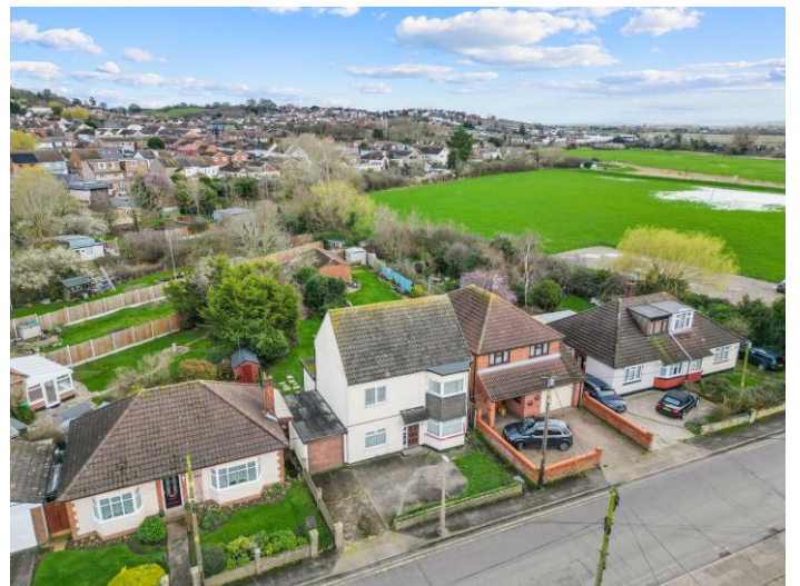
GARAGE With up and over door. Door to REAR GARDEN.