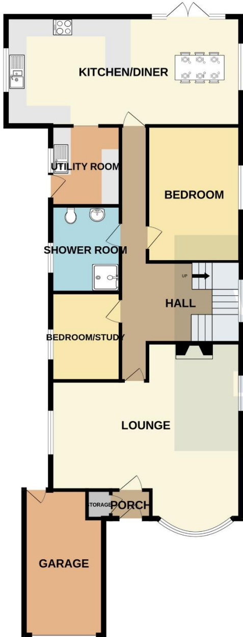
GROUND FLOOR 1349 sq.ft. (125.3 sq.m.) approx.