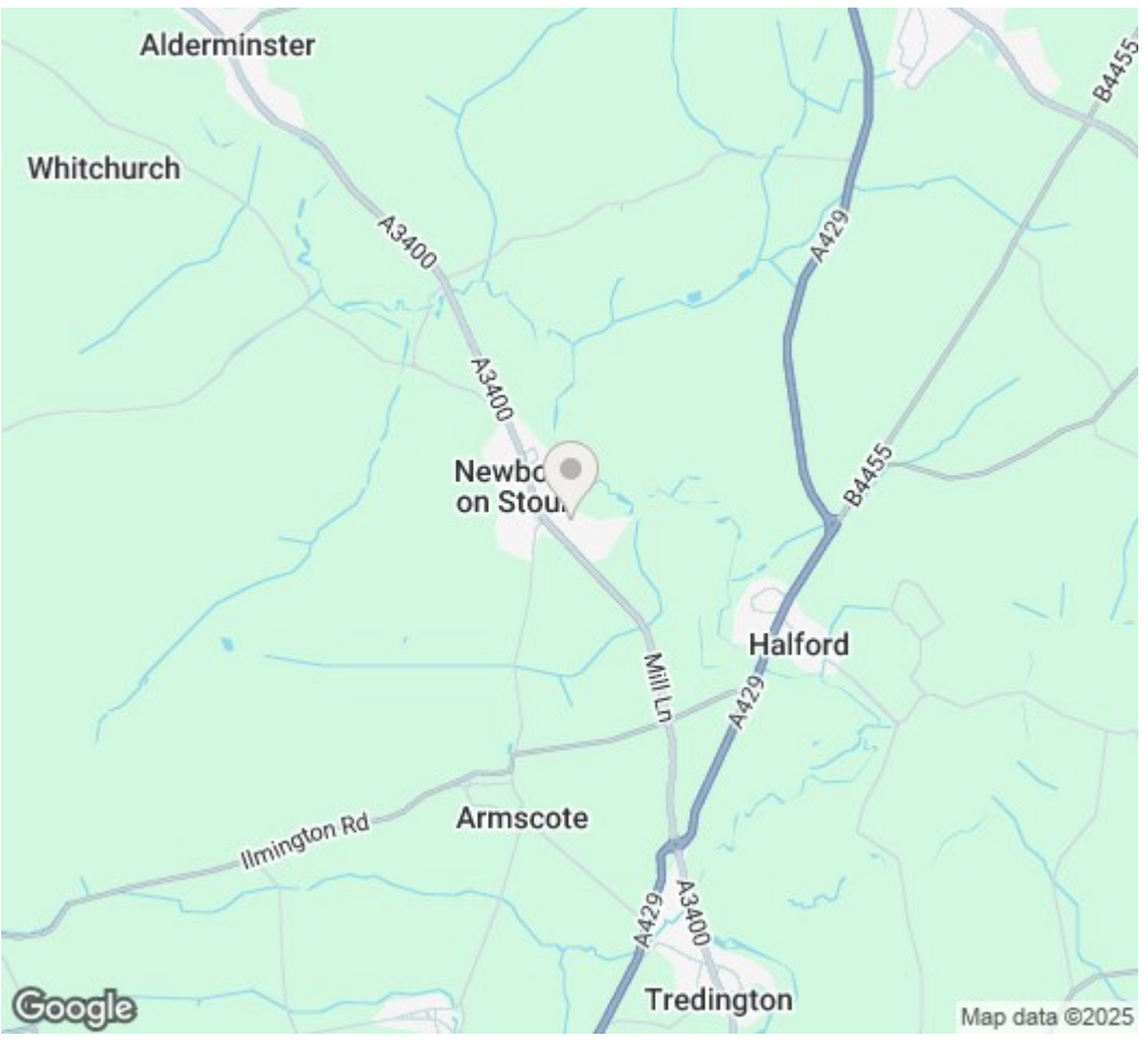
DISCLAIMER: Peter Clarke & Co LLP themselves and for the vendors or lessors of this property whose agents they are, give notice that the particulars are set out as a general outline only for the guidance of intending purchasers or lessors, and do not constitute part of an offer or contract; all descriptions, dimensions, references to condition and necessary permission for use and occupation, and other details are given without responsibility and any intending purchasers or tenants should not rely on them as statements or presentations of fact but must satisfy themselves by inspection or otherwise as to the correctness of each of them. Room sizes are given on a gross basis, excluding chimney breasts, pillars, cupboards, etc. and should not be relied upon for carpets and furnishings. We have not carried out a detailed survey and/or tested services, appliances and specific fittings. No person in the employment of Peter Clarke & Co LLP has any authority to make or give any representation of warranty whatever in relation to this property and it is suggested that prospective purchasers walk the land and boundaries of the property, prior to exchange of contracts, to satisfy themselves as to the exact area of land they are purchasing.

Multi-award winning offices serving South Warwickshire & North Cotswolds