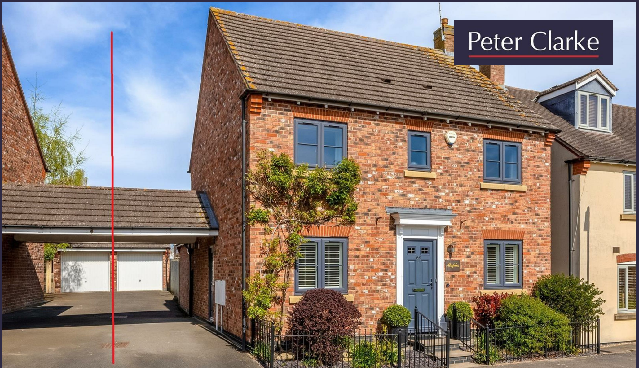
Maples, 66 Railway Crescent, Shipston-on-Stour, CV36 4GE