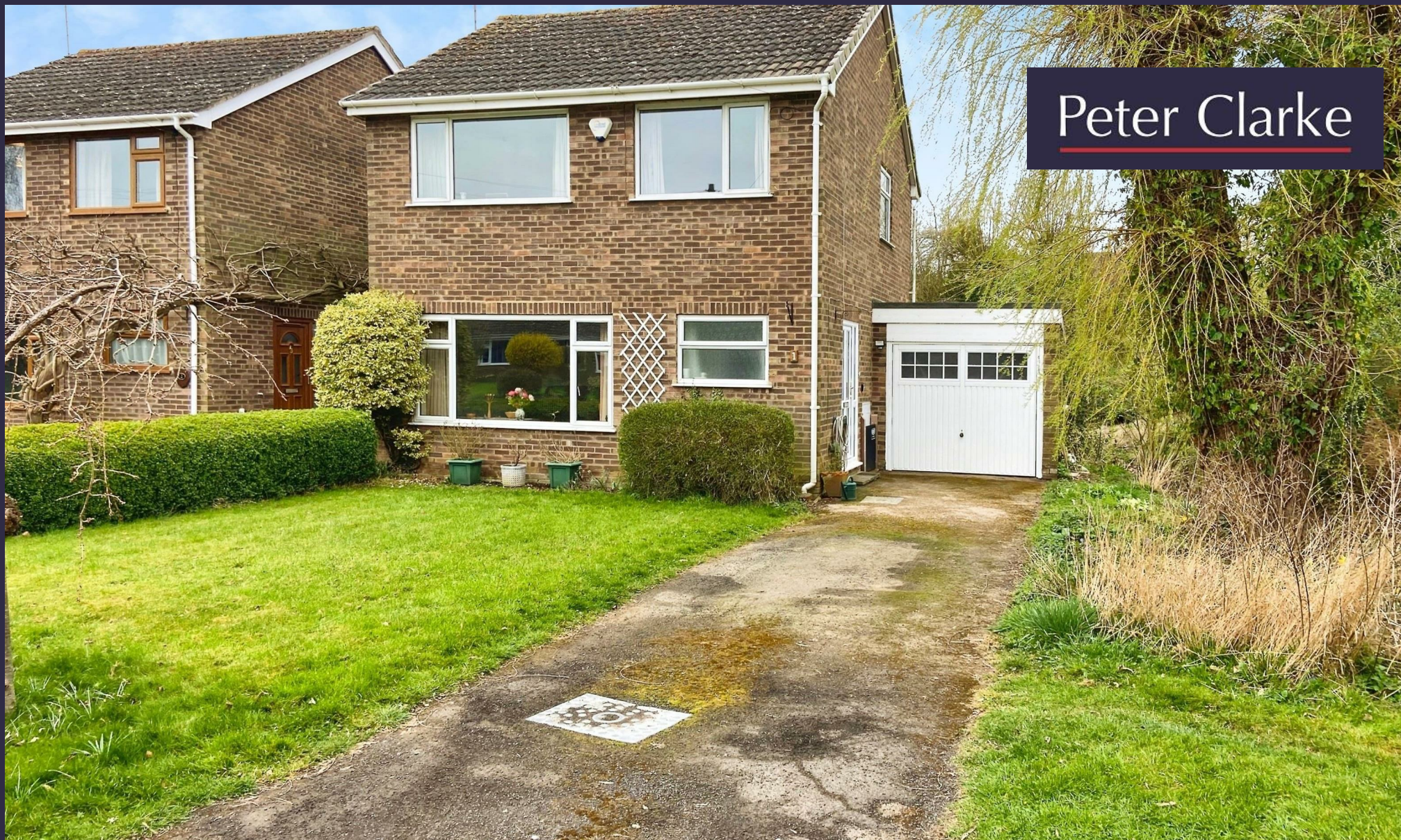
1 Orchard Close, Lower Brailes, Banbury, OX15 5AH