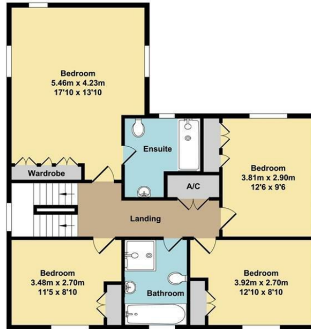
1st Floor Approx. Floor Area 77.46 Sq.M. (834 Sq.Ft.)