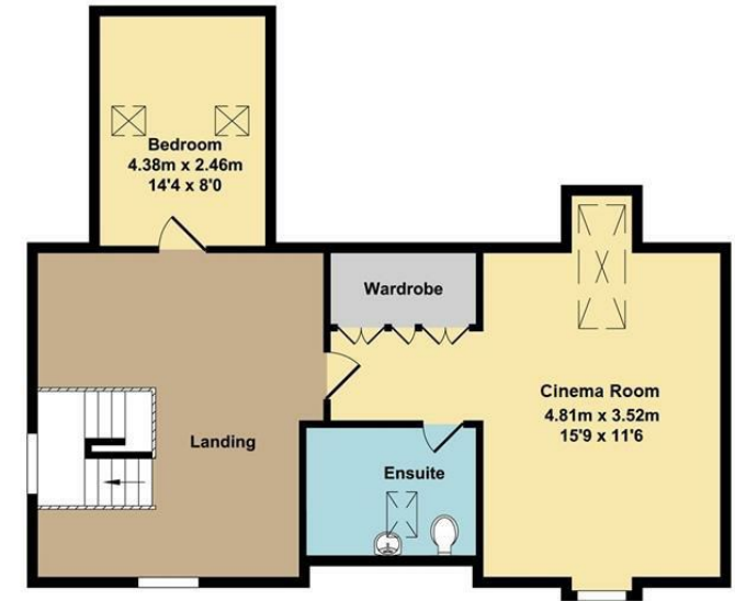
2nd Floor Approx. Floor Area 57.38 Sq.M. (618 Sq.Ft.)