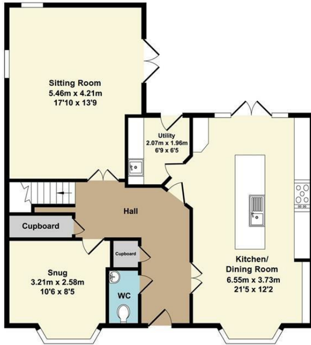
Ground Floor Approx. Floor Area 79.13 Sq.M. (852 Sq.Ft.)

Whilst every attempt has been made to ensure the accuracy of the floor plan contained here, measurements of doors, windows, rooms and any other items are approximate and no responsibility is taken for any error, omission, or mis-statement. This plan is for illustrative purposes only and should be used as such by any prospective purchaser. The services systems and appliance shown have not been tested and no guarantee as to their operability or efficiency can be given