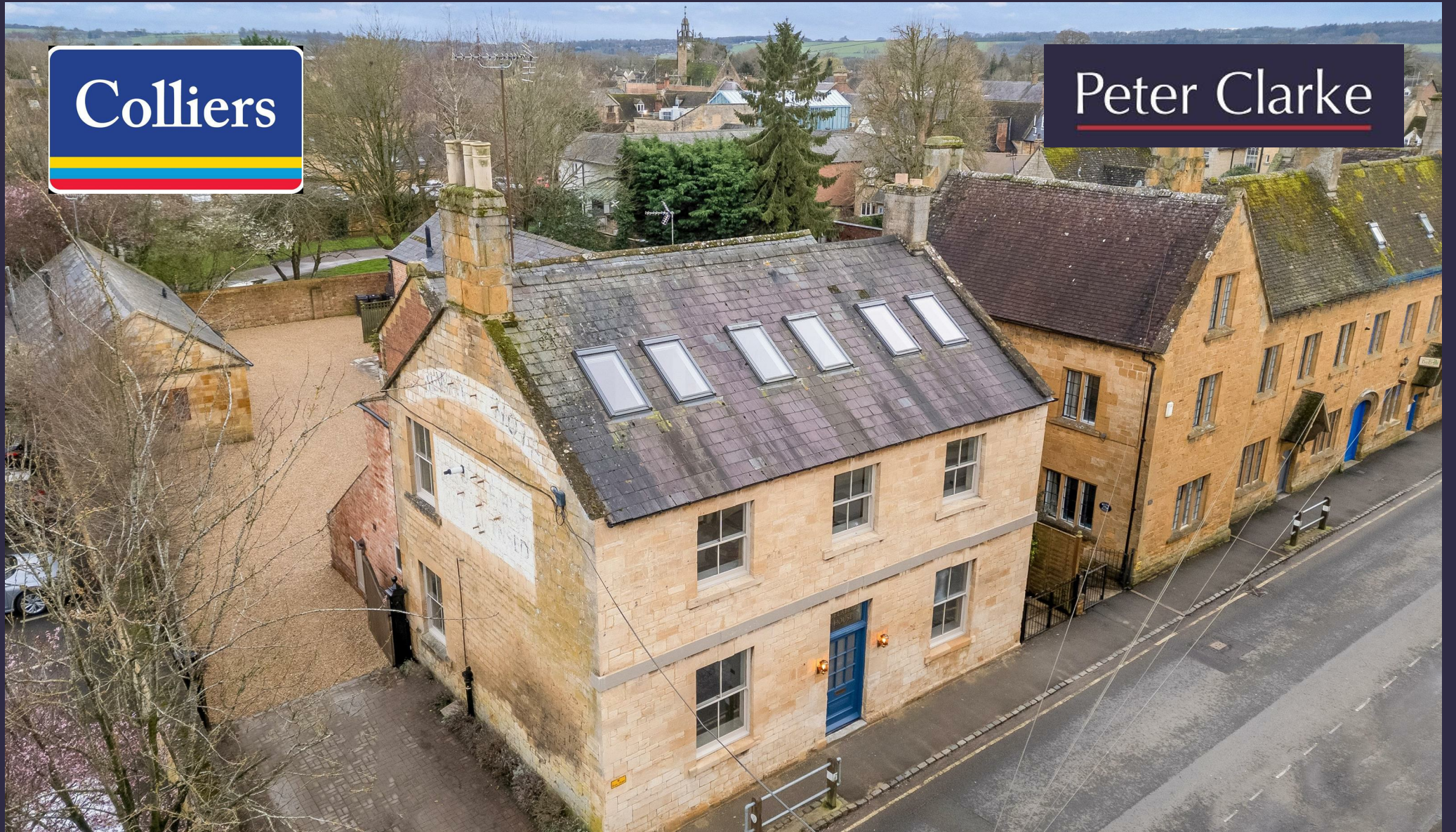
Delabere House, New Road, Moreton in Marsh, GL56 0AS