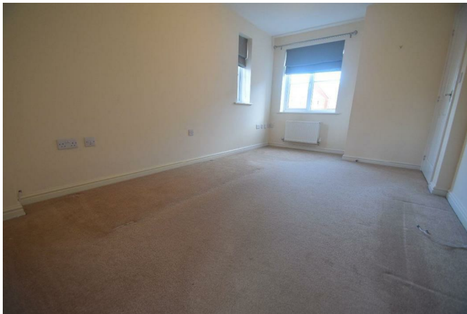
with storage cupboard