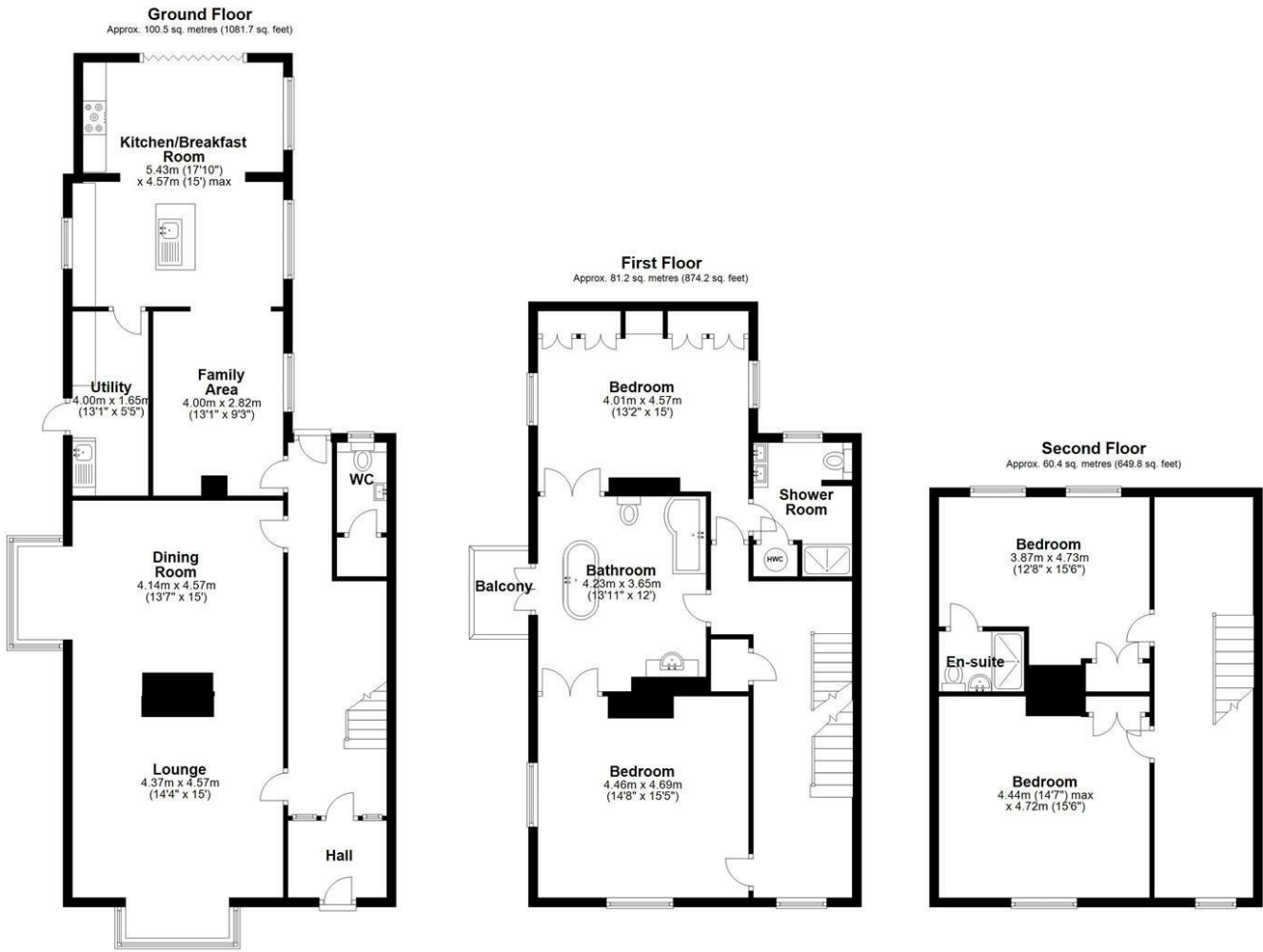
Total area: approx. 242.1 sq. metres (2605.8 sq. feet)