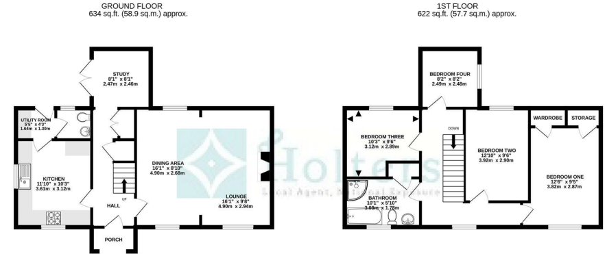
TOTAL FLOOR AREA: 1256 sq.ft. (116.7 sq.m.) approx. Whilst every attempt has been made to ensure the accuracy of the floorplan contained here, measurements of doors, windows, rooms and any other items are approximate and no responsibility is taken for any error, omission or mis-statement. This plan is for illustrative purposes only and should be used as such by any prospective purchaser. The services, systems and appliances shown have not been tested and no guarantee as to their operability or efficiency can be given. Made with Metreps 10/04

Consumer protection from unfair trading regulations 2008 - Holters for themselves and for the vendors or lessors of this property whose agents they are give notice that: 1. These particulars are set out as a general outline only for the guidance of intended purchasers or lessors and do not constitute part of an offer or contract. 2. All descriptions, dimensions, reference to condition and necessary permissions for use and occupation, and other details are given without responsibility and any intending purchasers or tenants should not rely on them as statements or representations of fact but must satisfy themselves by inspection or otherwise as to the correctness of each term of them. 3. The vendor or lessors do not make or give, and neither do Holters for themselves nor any person in their employment have any authority to make or give any representation or warranty whatever in relation to this property.