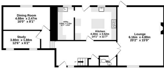
Ground Floor 89.1 sq.m. (959 sq.ft.) approx.