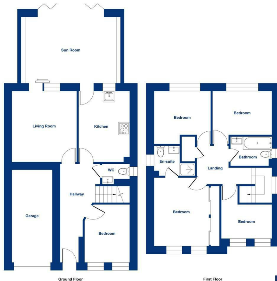
Illustration for identification purposes only, measurements are approximate, not to scale. Produced by Elements Property