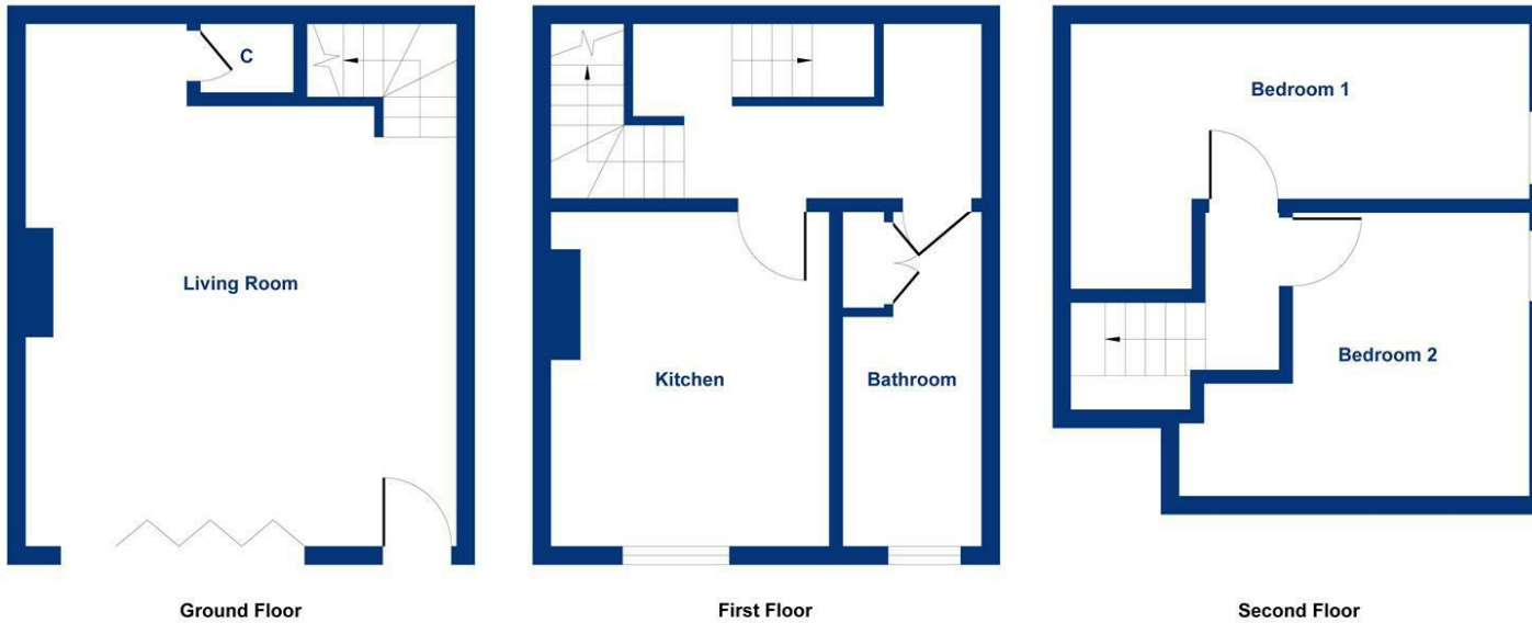
Illustration for identification purposes only, measurements are approximate, not to scale. Produced by Elements Property