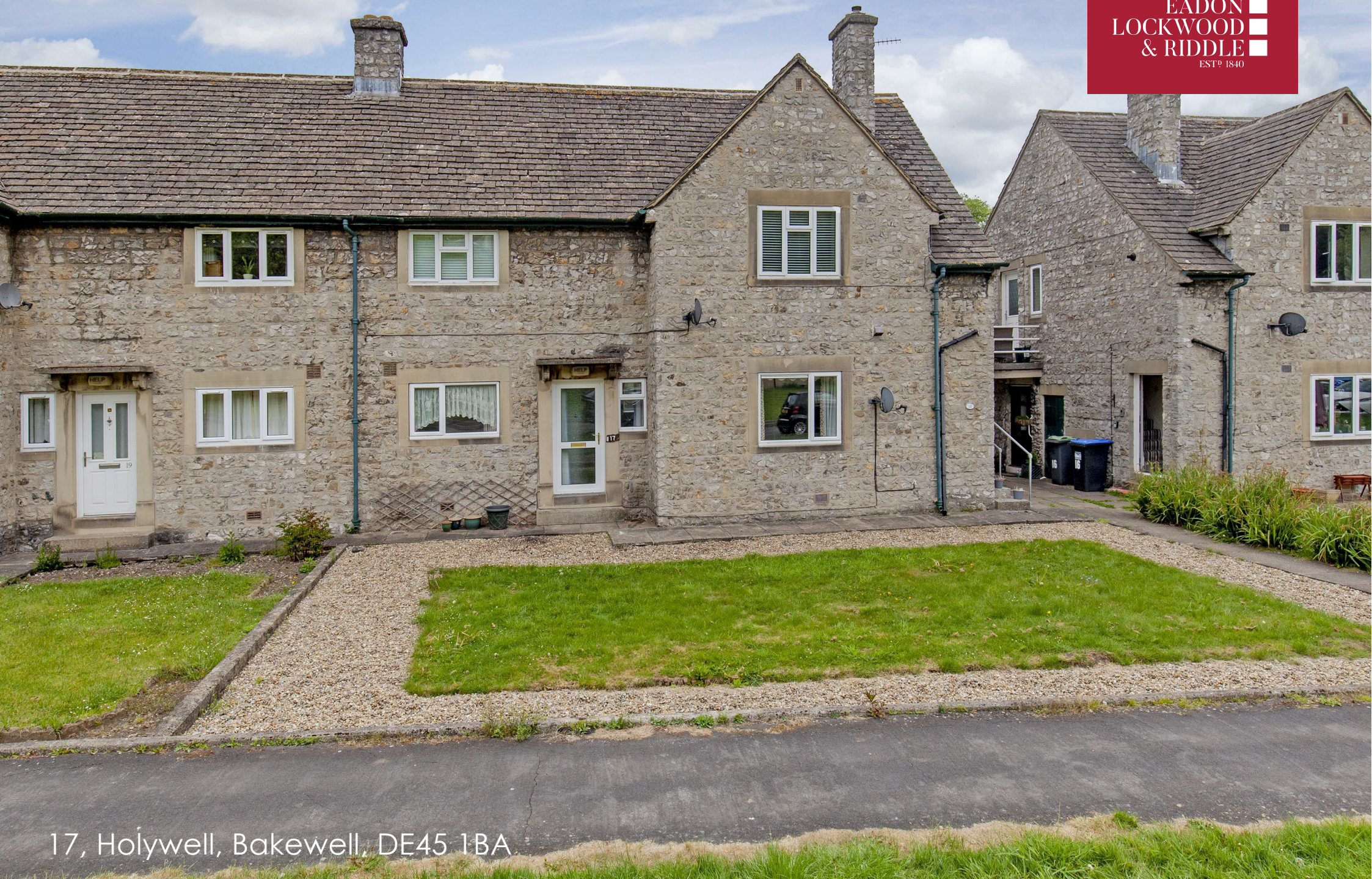
17, Holywell, Bakewell, DE45 1BA