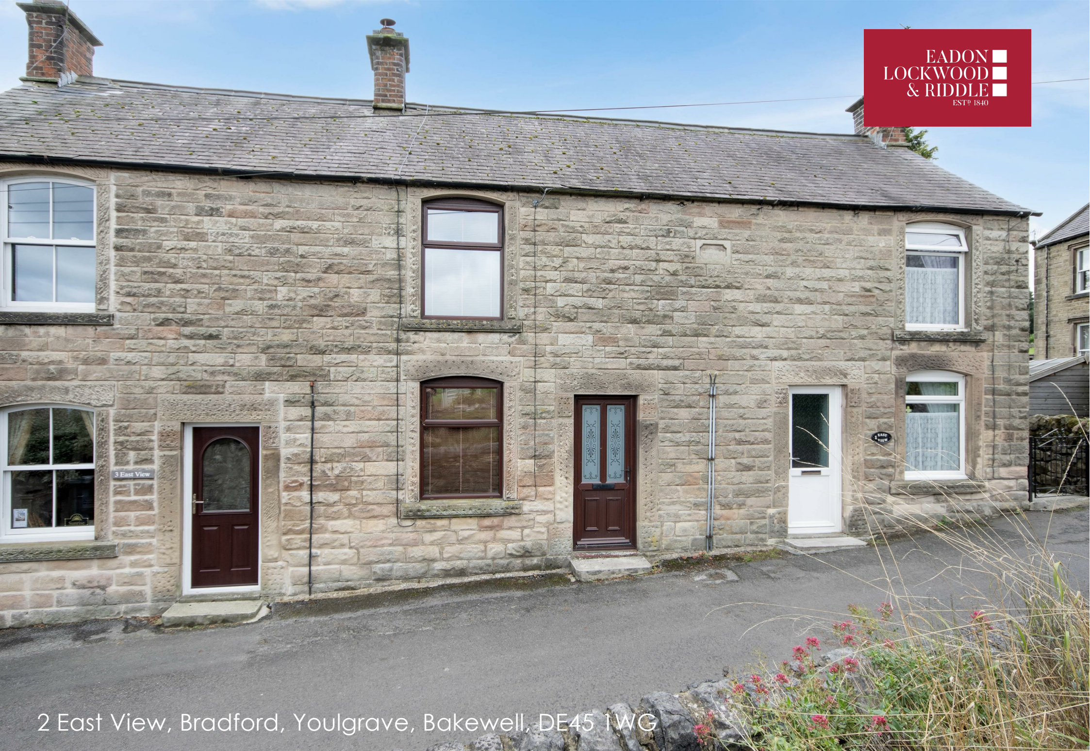
2 East View, Bradford, Youlgrave, Bakewell, DE45 1WG