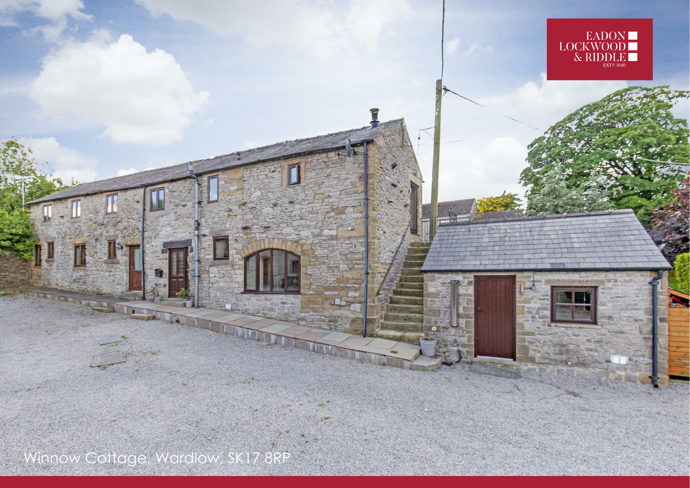
Winnow Cottage, Wardlow, SK17 8RP