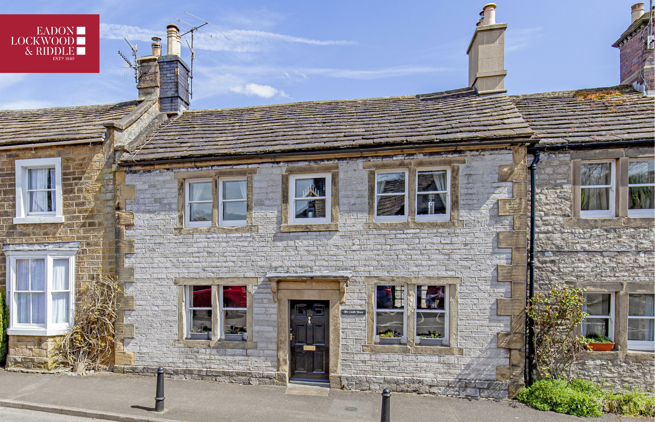
The Candle House, Greaves Lane, Ashford-In-The-Water, DE45 1QH